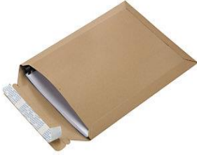
Agreement of Integrity Pact Proposal (Sealed)

The following mention shall be indicated on the top left corner of each sealed envelope: