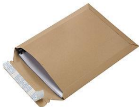
Technical CD Proposal (Sealed)