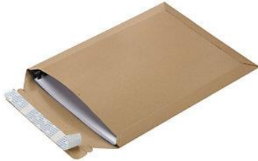
Large envelope of TENDER (Sealed)

The following mentions of TENDER shall be indicated on the top left corner of a large envelope: